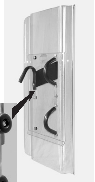
Rubber buffers mask front face bolt heads, for improved public safety

The multi purpose design of the shield allows for numerous tactics to be used, including group formations, typically with long C&R shields, individual protection for snatch squads, and violent man scenarios when used with straight arm C&R tactics. Fully interlocking with all Armadillo shields and capable of surviving extensive impact from thrown objects petrol bombs and edged weapons.