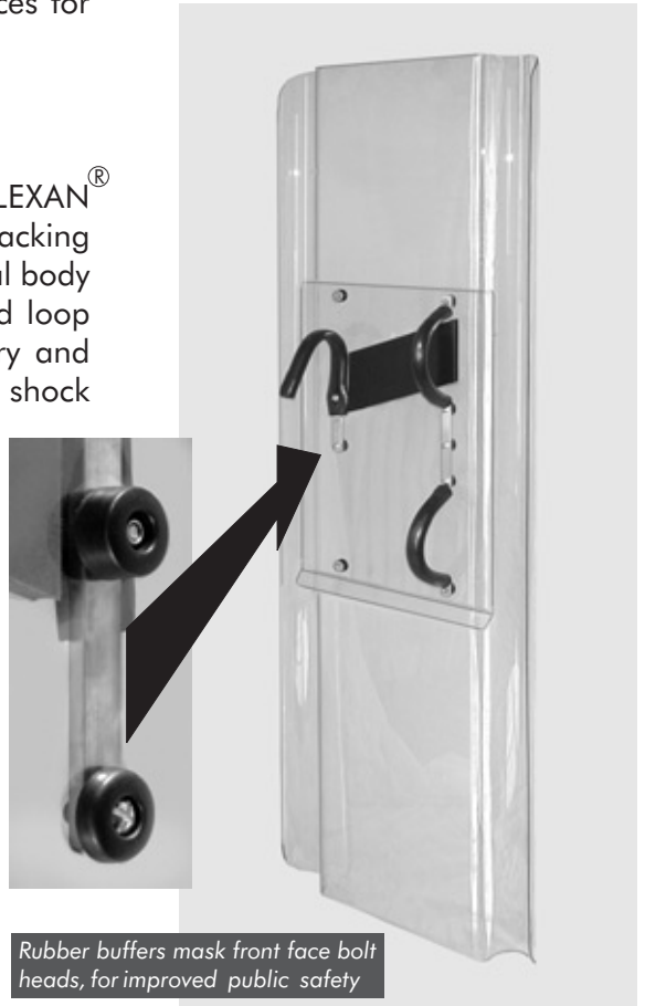
Rubber buffers mask front face bolt heads, for improved public safety

The multi purpose design of the shield allows for numerous tactics to be used. Group formations are enhanced due to the rapid interlocking capability, a typical mutual protection unit being three medium shields in front and three intermediate shields for overhead protection.