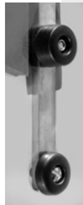
Rubber buffers mask front face bolt heads, for improved public safety