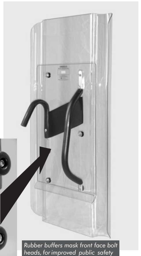
Rubber buffers mask front face bolt heads, for improved public safety

Fully interlocking with all Armadillo shields, particularly as an overhead shield, and capable of surviving extensive impact from thrown objects petrol bombs and edged weapons.