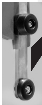
Rubber buffers mask front face bolt heads, for improved public safety