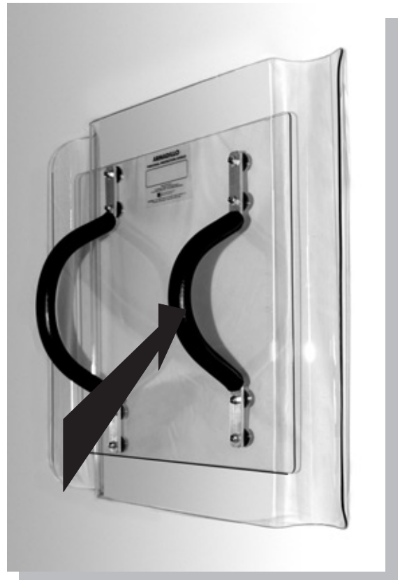
Rubber buffers mask front face bolt heads, for improved public safety

The shield is ideally suited to tactics where fast response intervention is required but space is limited. It is also ideal for roof work where personal protection is required without the added hindrance of a large heavy shield. Twin loop handles are suited for straight arm tactics such as take downs and angry man. Fully interlocking with all Armadillo shields and capable of surviving extensive impact from thrown objects and edged weapons.