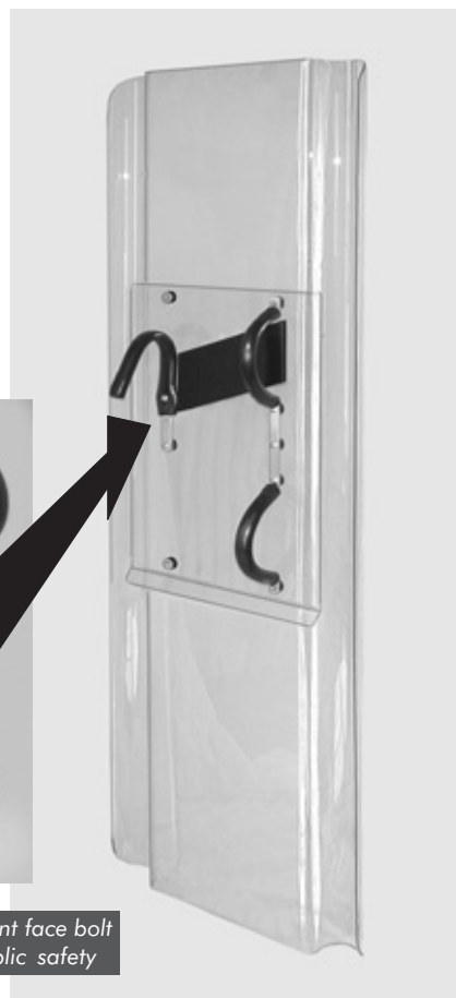
Rubber buffers mask front face bolt heads, for improved public safety

Fully interlocking with all Armadillo shields.